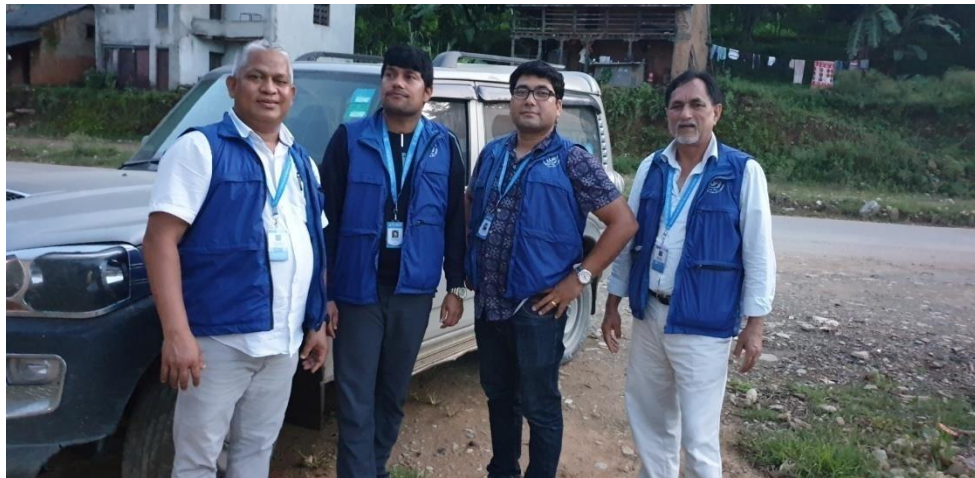
FAAN Officials return from Chitwan after Field Study