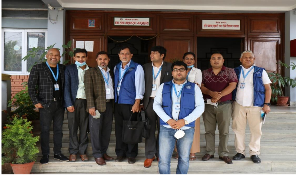
FAAN Officials at collective Photo Session after meeting with Forest Minister