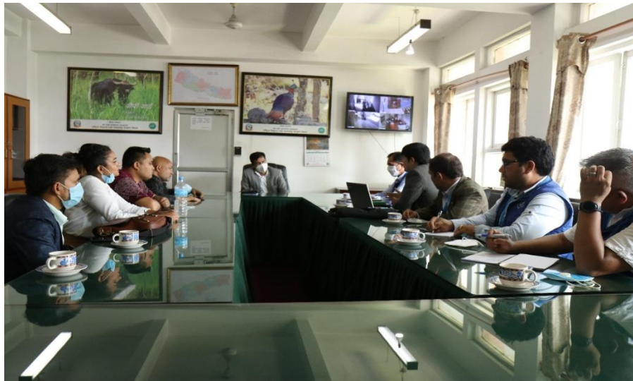
Discussion with Hon'ble Minister Shakti Bahadur Basnet on the Rajkumar Praja Death Incident